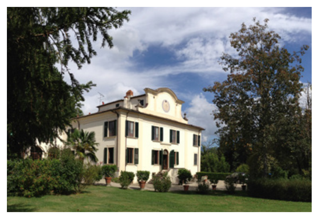
Villa il Corniolo is located in Mucciano, Mugello, an area of Tuscany in Central Italy. At the footsteps of Appennino Tosco Emiliano, 30 minutes away from Florence and 45 minutes from Bologna.

One of the peculiarities of Corniolo Art Platform is its charm, that makes it a center around which international and local artists gravitate.